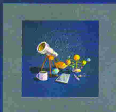
VIDYARTHI VIGYAN MANTHAN